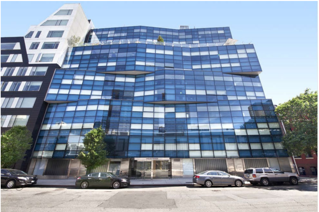
Chelsea Modern via Stribling