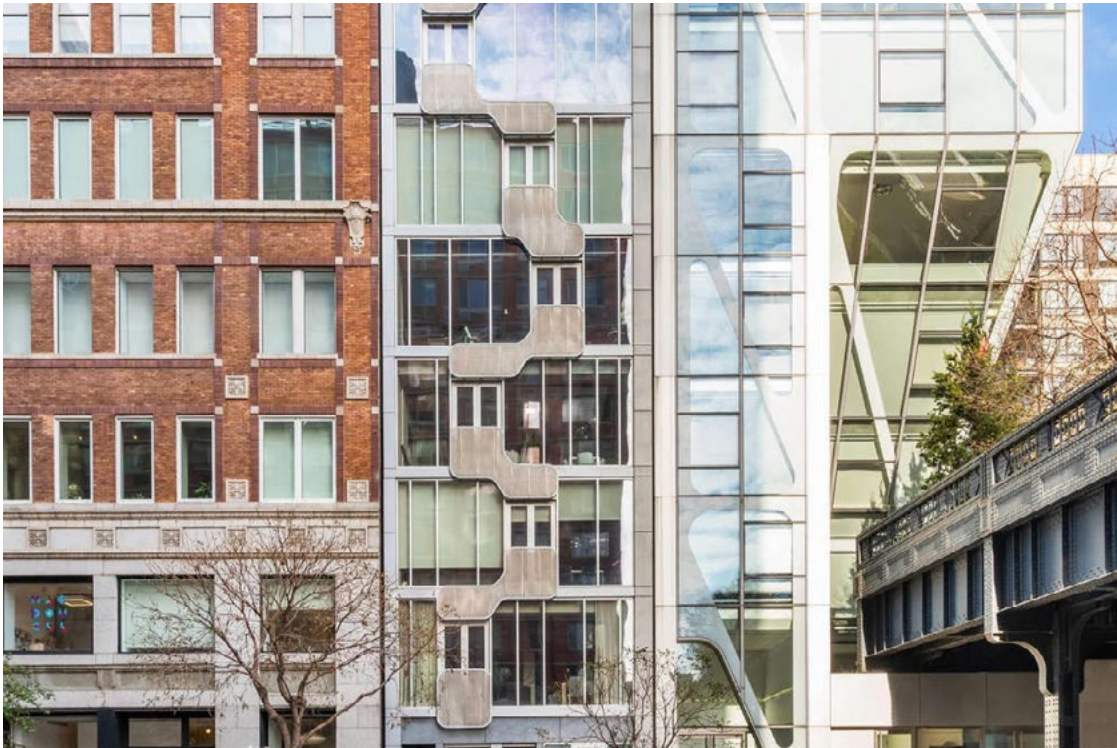
High Line 519 via Elliman

519 West 23rd Street Design by Roy Studio 1 three-bedroom unit for $4.4M