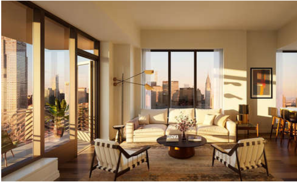
447 West 18th Street Design by Audrey Matlock Architect 1 five-bedroom unit for $7.5M