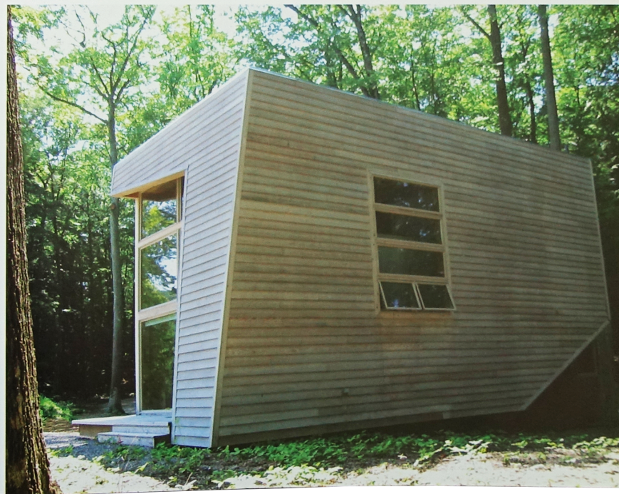
The subtly distorted geometry of the north façade.→