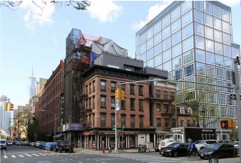
512 Greenwich Street construction progress as of early May