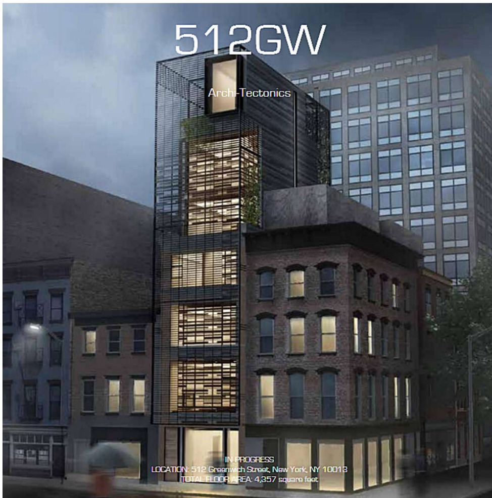
Rendering of the single-family townhouse under construction at 512 Greenwich Street

BY CITYREALTY STAFF THURSDAY, MAY 4, 2017